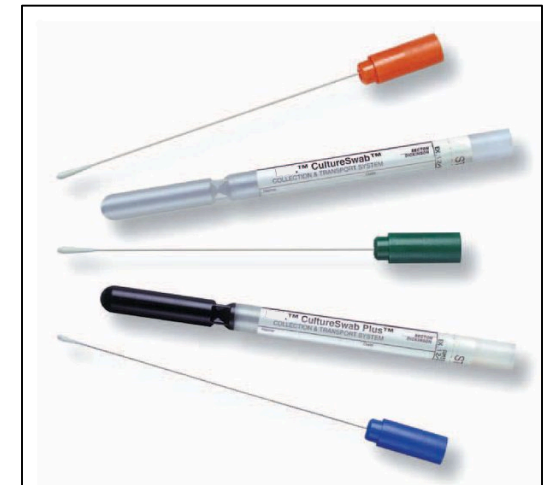
Amies Swab with Transport Tube