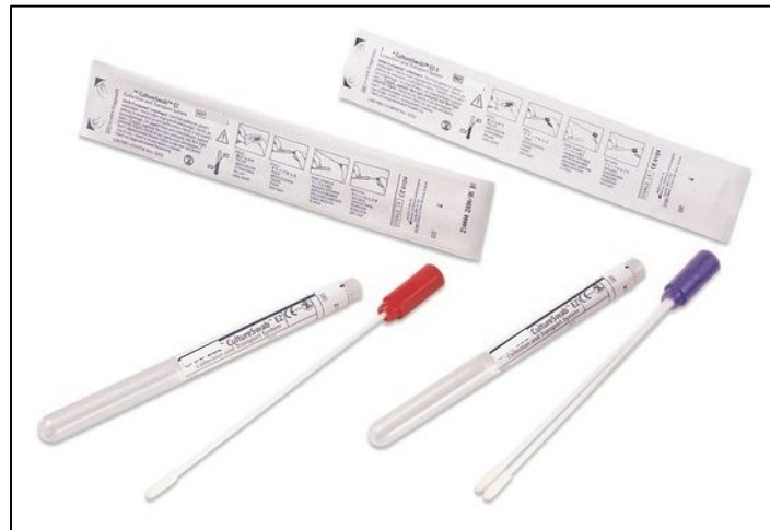
Stuart Swab with Transport Sleeve